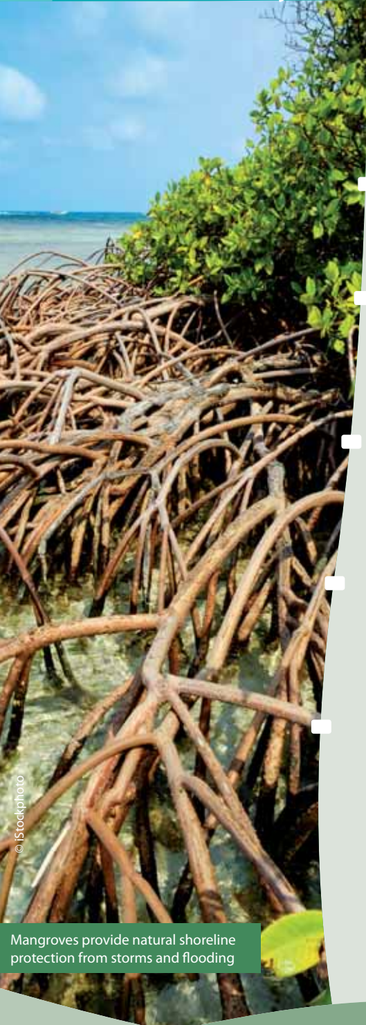
Mangroves provide natural shoreline protection from storms and flooding

Terrestrial and marine ecosystems play an important role in regulating climate. They currently absorb roughly half of man-made carbon emissions.