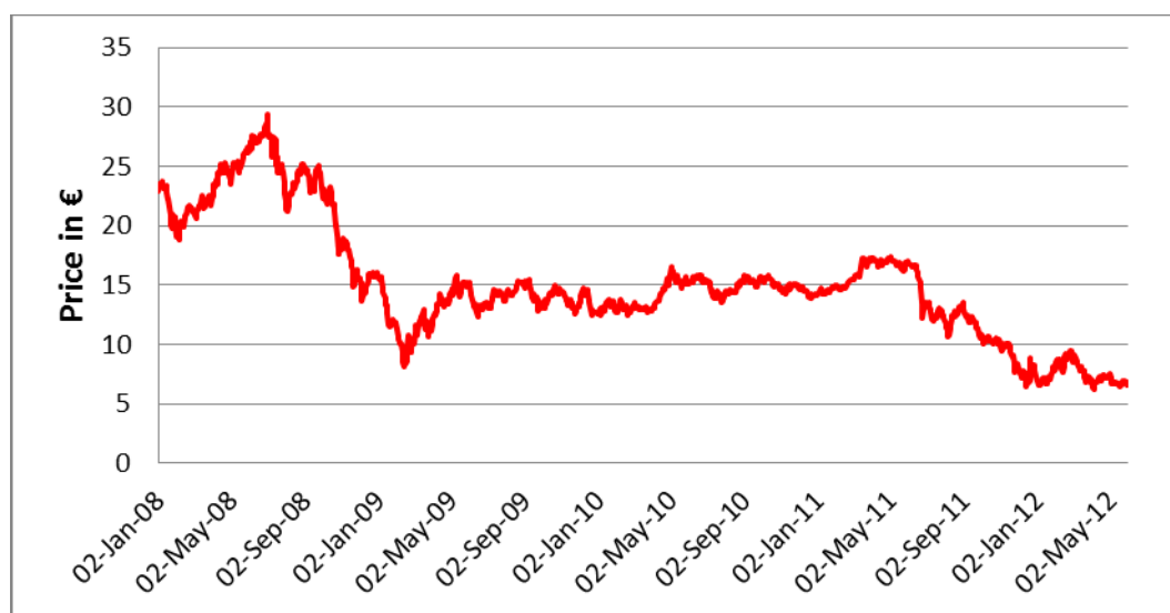
Figure 1: Carbon price evolution

Source: Intercontinental Exchange. Data for front-year futures contracts with delivery in December