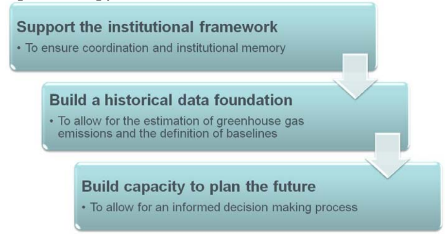
Figure 4 Setting priorities

The figure below illustrates a potential method for priority setting.