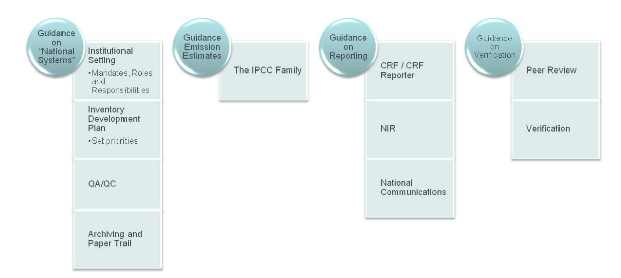
Figure 3 Guidance Needs on MRV

As can be seen in the figure below, stakeholders considered necessary that guidance addresses the design and functions of a "national system", methodologies for estimating GHG emissions (which are already available – the IPCC guidelines), reporting (both for reporting GHG emissions and National Communications) and Verification (which could include guidance on verification tout court and guidance on peer review).