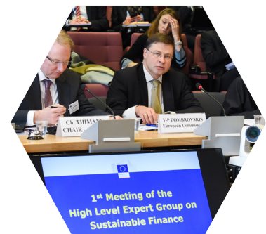
Vice-President Valdis Dombrovskis at the 1 st meeting of the High Level Expert Group on Sustainable Finance

These regions are working in partnership with teams of European Commission experts to boost their innovation capacity, remove investment barriers, equip workers with the right skills and prepare for industrial and societal change, on the basis of their smart specialisation strategies. The pilot seeks to find new ways to help these regions harness globalisation by decarbonisation, innovation, digitisation, and developing people's skills, in particular those regions which have experienced significant employment loss in coal, steel or other energy intensive industries.