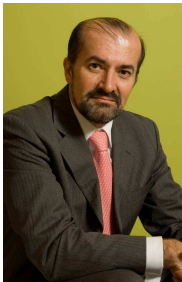
Aniceto Zaragoza President of EUPAVE

The longevity and durability of concrete structures is well-known. Just like the fact that concrete pavements hardly need any maintenance, which makes that traffic is less disturbed and congestion is avoided. But who knows that concrete roads can contribute to CO 2 reduction, even if the opposite often is told? There are several direct positive aspects of concrete which are present throughout the lifetime of the pavement : the uptake of CO 2 in the hardened concrete, the light reflectivity of a concrete surface which contributes to the cooling of our planet and last but not least : the reduced fuel consumption of heavy vehicles riding on a non-deformable pavement. This third aspect will be highlighted in this publication, based on a number of international studies and researches. We also encourage any additional research, preferably on European scale, to confirm the results which all show a benefit for concrete pavements. We are convinced that this is useful information in a decision making process for sustainable road infrastructure and we hope that one day it can be part in evaluation procedures for green public procurement.