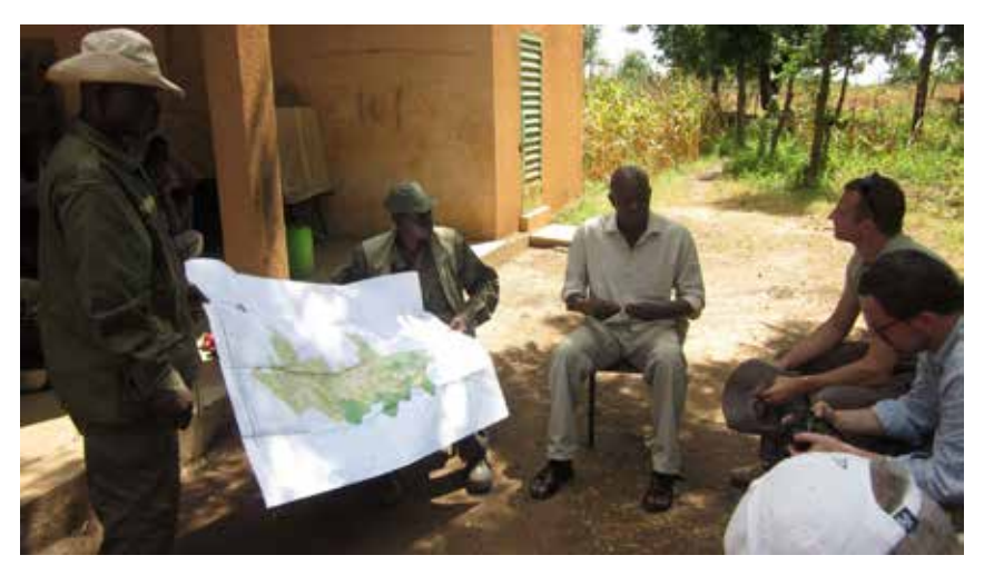
Forest inventory by Burkinabe authorities.