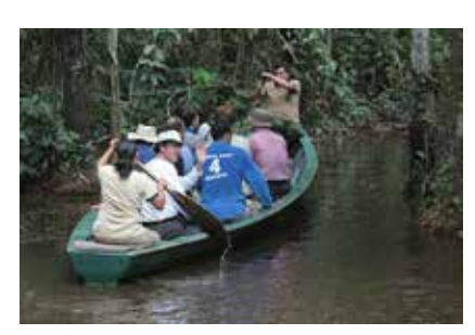
The participating companies visited Tambopata in December 2014.

Dutch companies have joined forces with FMO, the Dutch Development Bank and the Dutch Platform