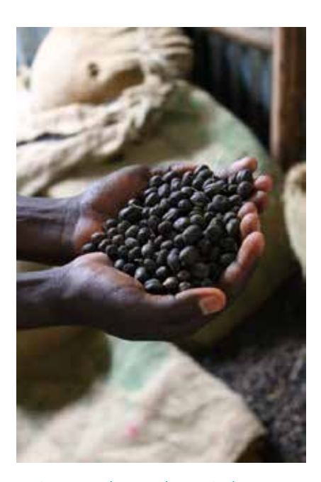
In Oromia, Ethiopia, the BioCarbon Fund will work with the private sector to support sustainable coffee to reduce emissions from land use.

more sustainable land-management practices. This supports forest nations in implementing ambitious plans to halt deforestation while meeting their development needs.