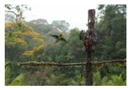
Parrots in Costa Rica.

Ultimately, the supporting measures for preserving landscapes take into account the different types of land use that lead to increased carbon storage and which have to be considered when designing