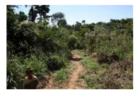
The forest in the Miri Poty Community. Indigenous and small-peasant communities support the conservation of forest resources in Paraguay.

seed varieties and of a simplified forest inventory, development of participatory forest, water and soil management plans, implementation of soil conservation activities, training on food preservation techniques, diversification of agricultural production and support for the commercialisation of the products, and training on ethnic, human and environmental rights, etc.