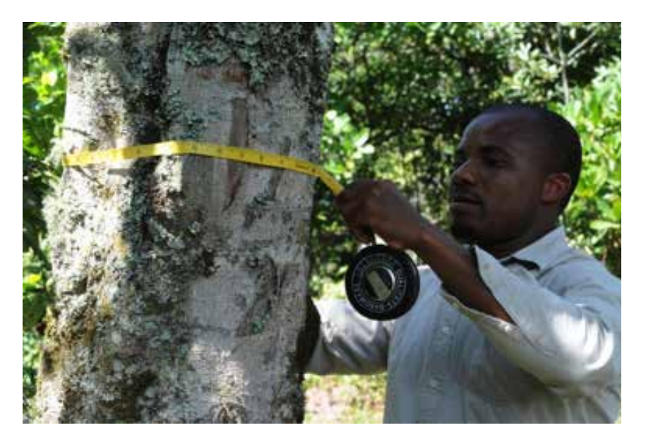
A forest ranger taking measurements of a tree at MegeniKitasha in the Rombo District in Moshi, Tanzania.

A set of open-source data tools has been released under the Open Foris Initiative: <u>http://www.openforis.org</u>