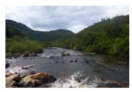
Watershed in Belize.

entral America is the tropical region most severely affected • by climate change worldwide. Soil degradation, forest loss and monocultures make it even more vulnerable to climate change. The project is working closely with the Comisión Centroamericana de Ambiente y Desarrollo (CCAD) to create a carbon sink through forest landscape restoration (FLR) across the entire region. FLR is seen here as a comprehensive approach in a fragmented forest landscape that enhances ecosystem services and treats the entire landscape as a whole, thereby contributing to enhanced resilience to climate change as well as to mitigation. Improved agricultural and forest management practices can increase the carbon content in soils by 20-30%.