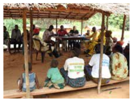
Engagement with local staleholders in the Republic of Congo to understant how existing benefit-sharing arranfement (local development funds in the forest sector) can ve used for channelling REDD+ incentives.

Improving land-use governance through building institutional capacity at decentralised level in the Democratic Republic of the Congo (DRC), exploring options for independent monitoring by civil society in Central Africa, and strengthening arrangements for benefit sharing in the Republic of Congo;