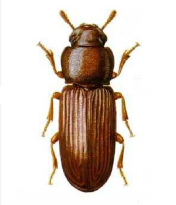
Tribolium confusum Flour beetle