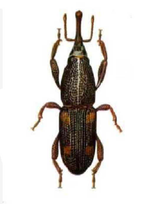
Sitophilus orizae Rice weevil